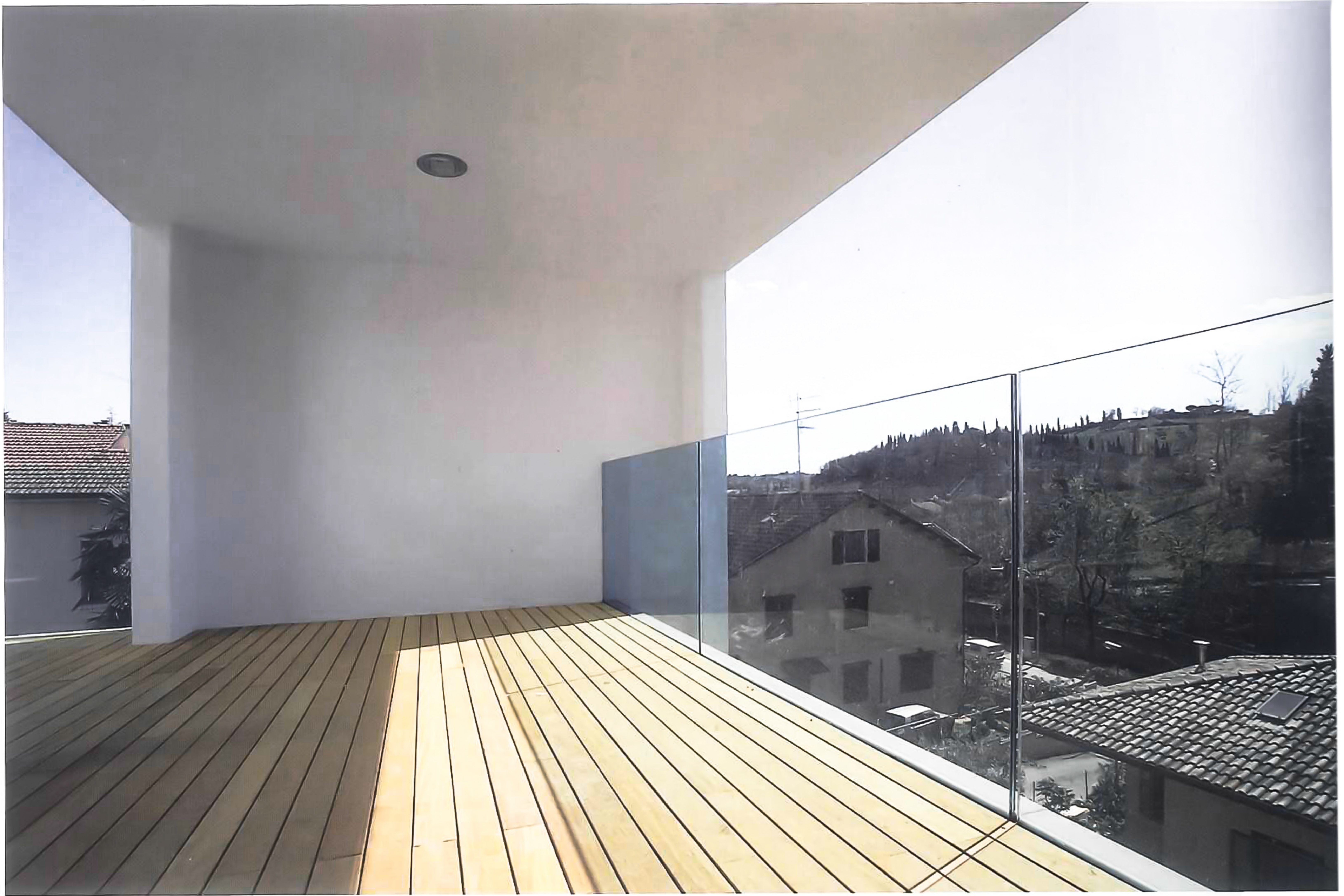
↑ | Terrace, wood flooring and glazed balustrade ← | Second and third floor plans