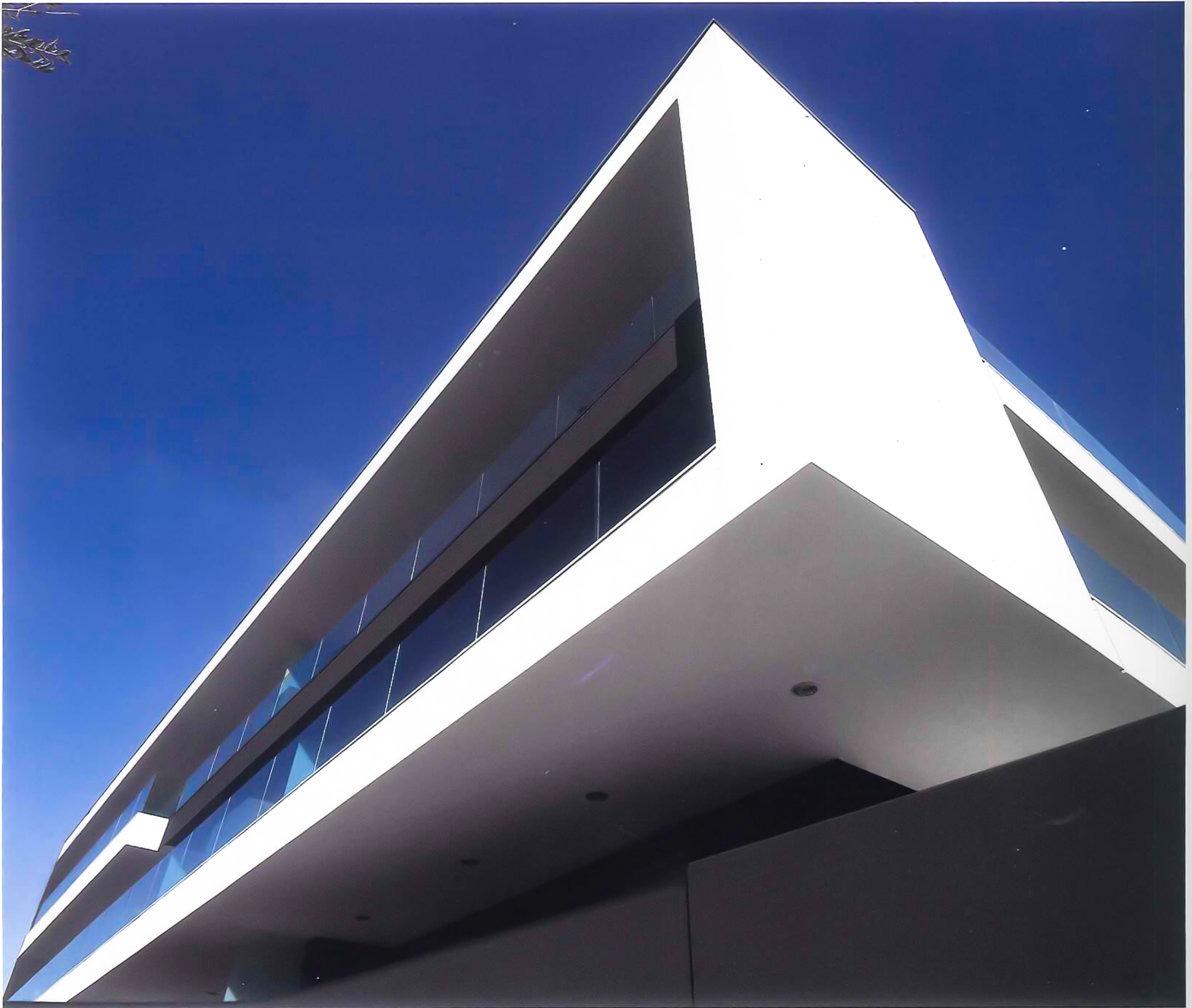
↑ | Front façade , view from street → | Detail , white façade, black fence and glazed balconies