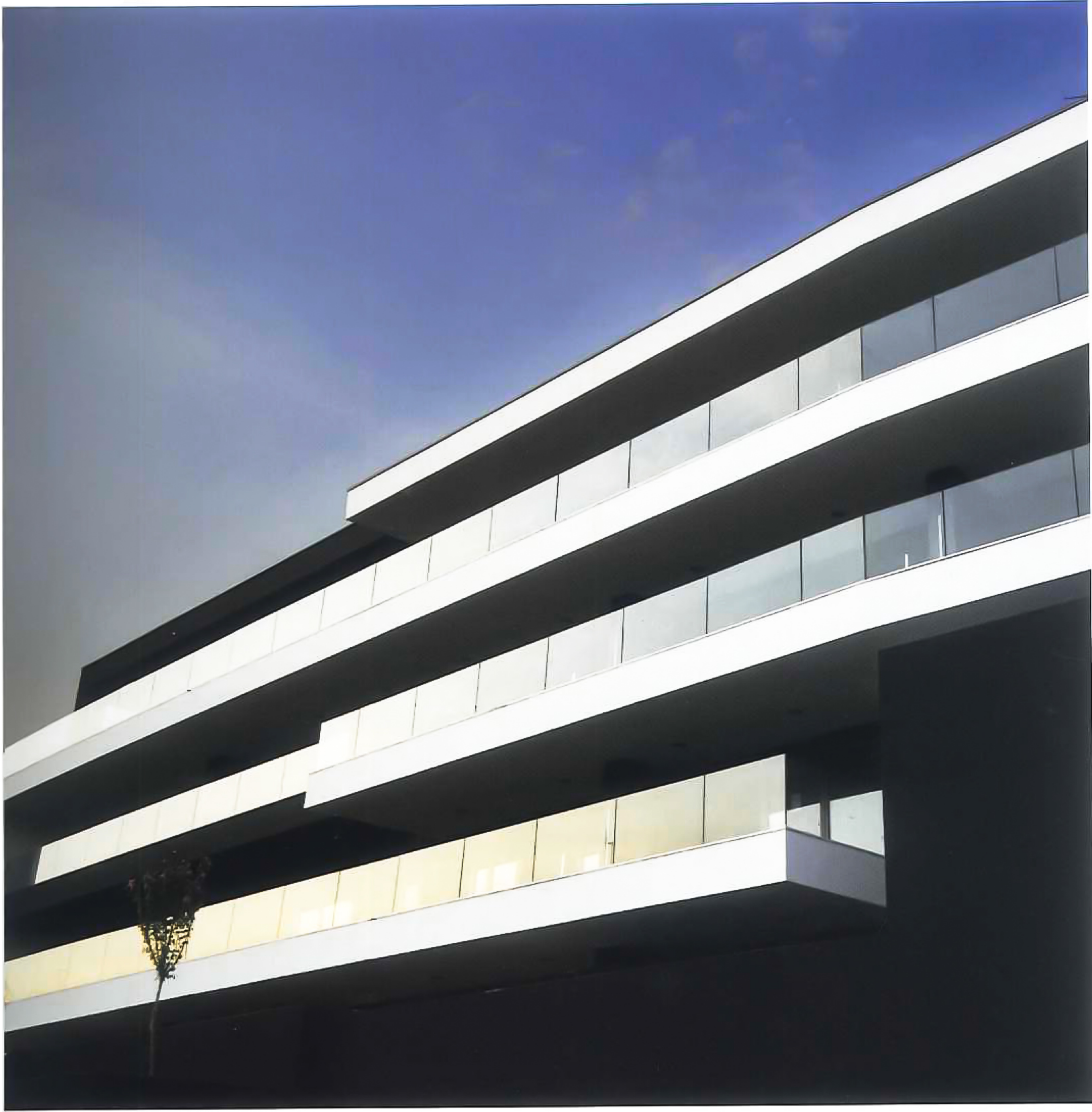
← | Façade, reflecting sunset ↓ | Sixth floor plan